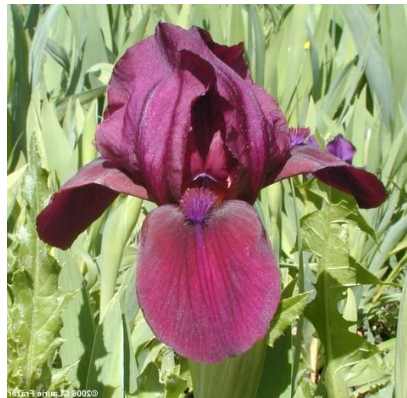
Cherry Garden - B. Jones '66 SDB