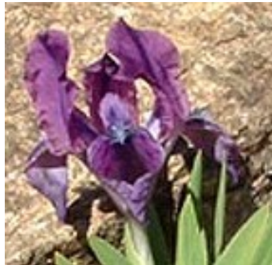
Atroviolacea - Todaro '1856 MDB