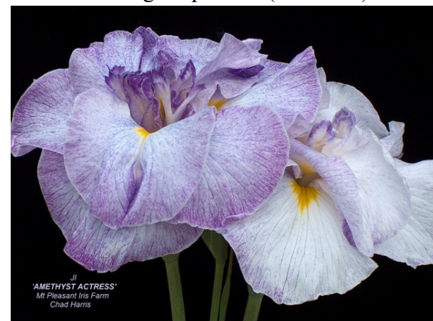
Amethyst Actress (Harris'19)