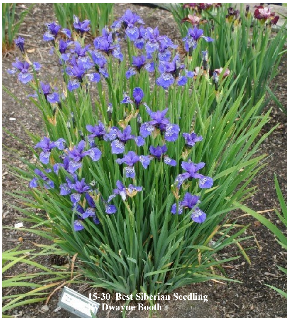
15-30 Best Siberian Seedling Dwayne Booth

Two other Siberians are shown one on page 6, is 'Moonstone Marvel' a 2017 introduction from Terry Aitken. Second, is 'Silliousness' on page 8, a 2020 introduction by Schafer/Sacks.