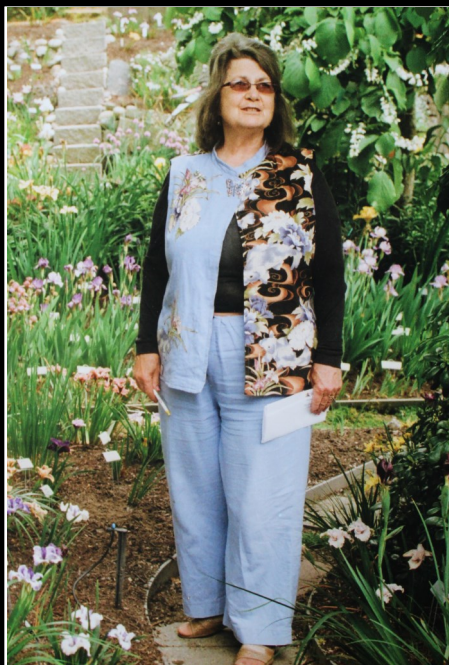
c. Mid-America Garden