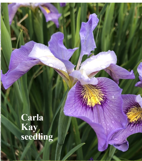
Carla Kay seedling