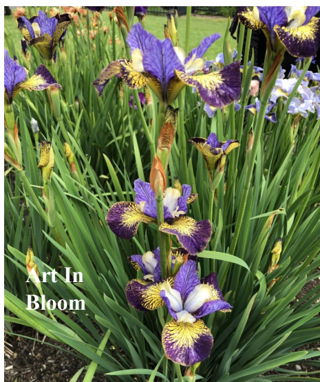
Art In Bloom